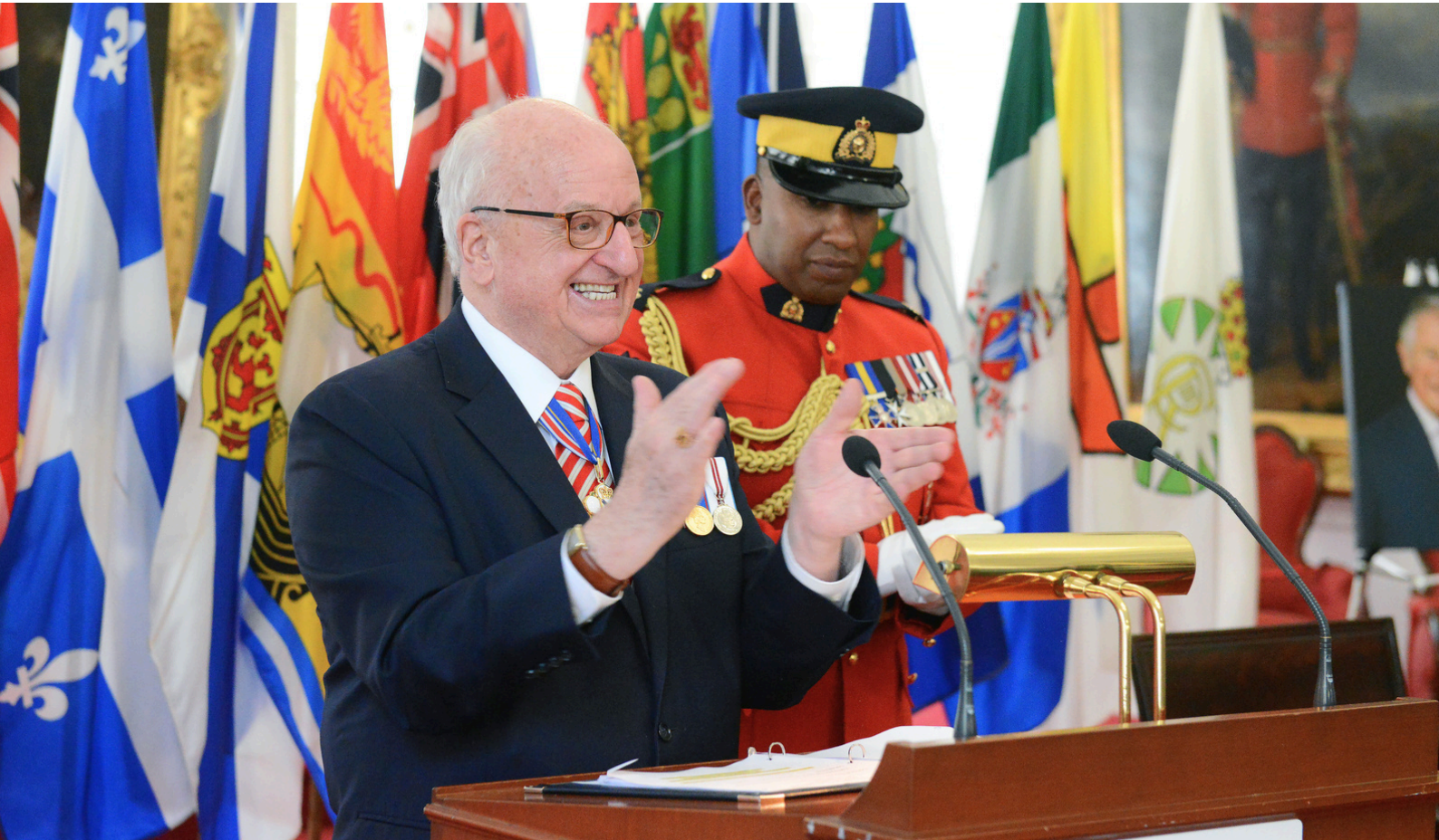
Coronation Year Citizenship Ceremony at Province House. May 23, 2023.