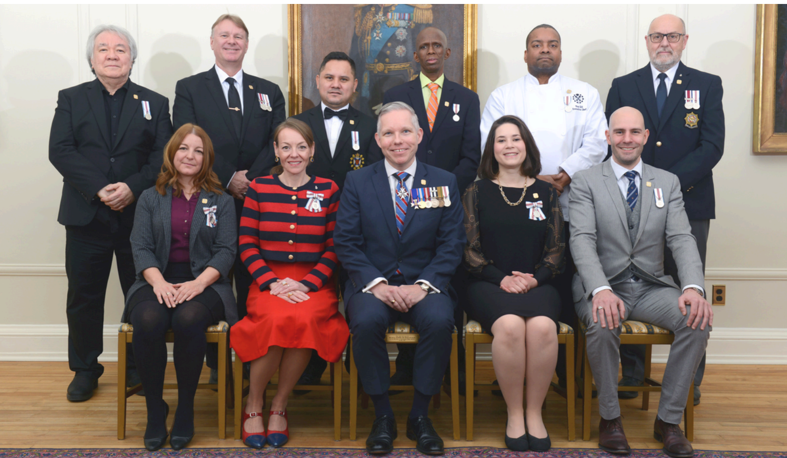
The Vice-Regal Household Staff.