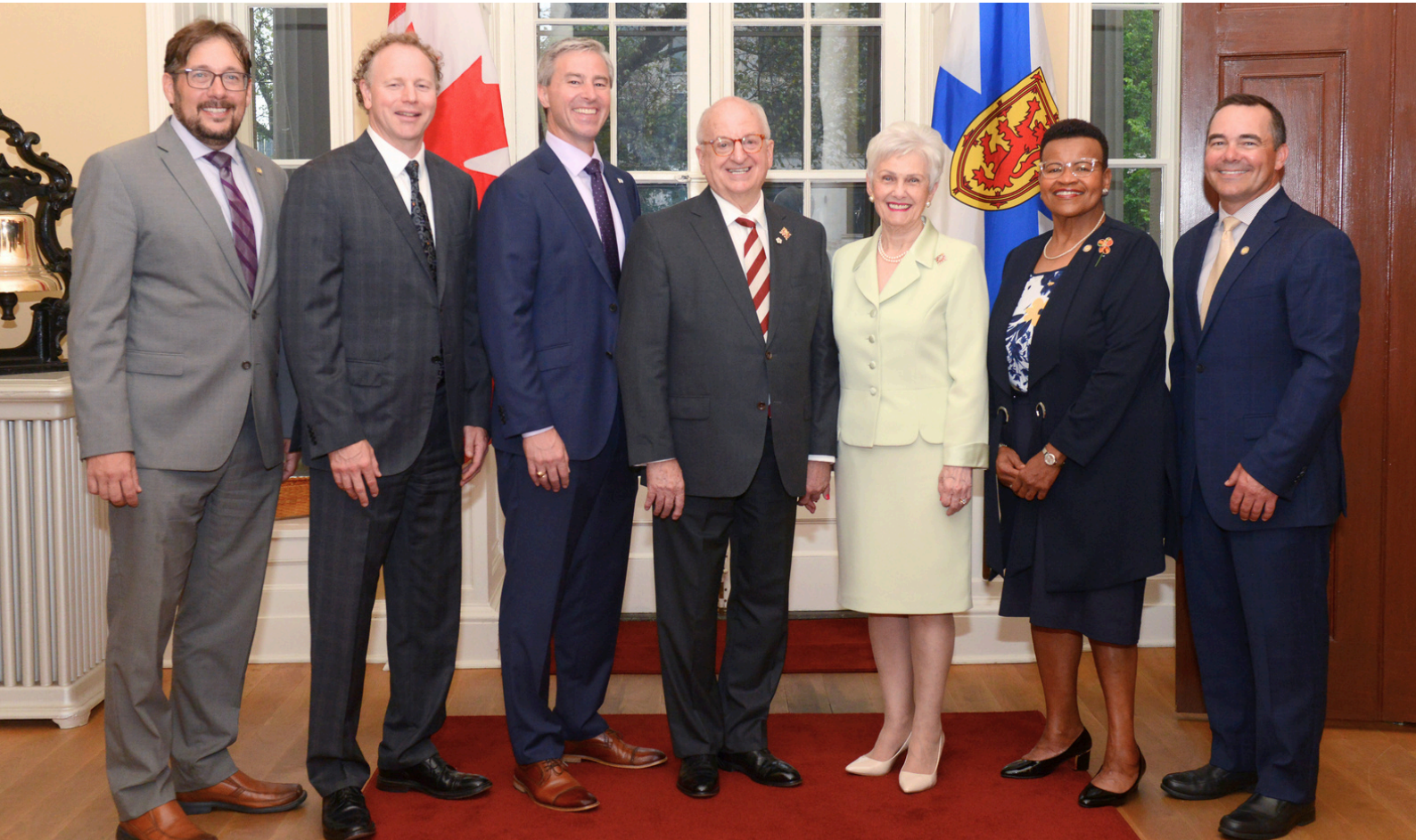
Swearing-In Ceremony for Members of His Majesty's Executive Council. September 14, 2023.

The Province of Nova Scotia witnessed historic appointments within His Majesty's Executive Council and the Judiciary in 2023. These appointments were formalized during Swearing-In Ceremonies held at Government House.