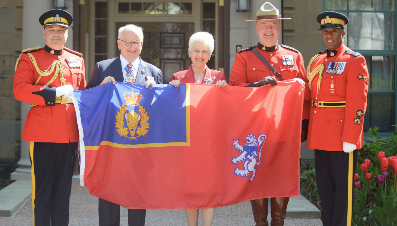
150th Anniversary of the Royal Canadian Mounted Police. May 23, 2023.