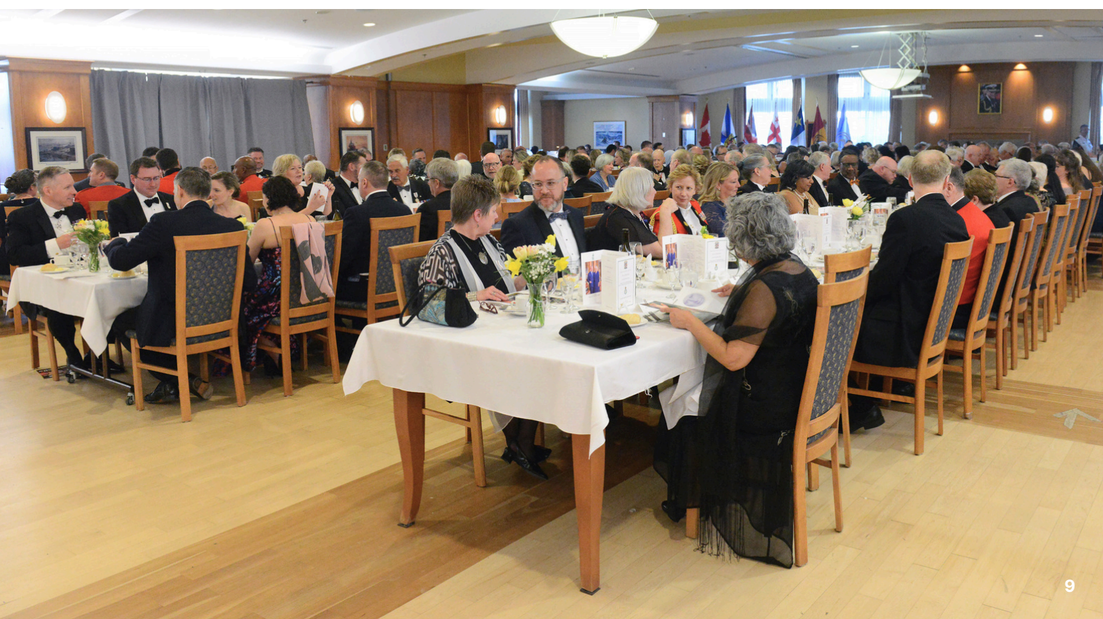
Provincial State Dinner, Canadian Forces Base Halifax, May 5, 2023.