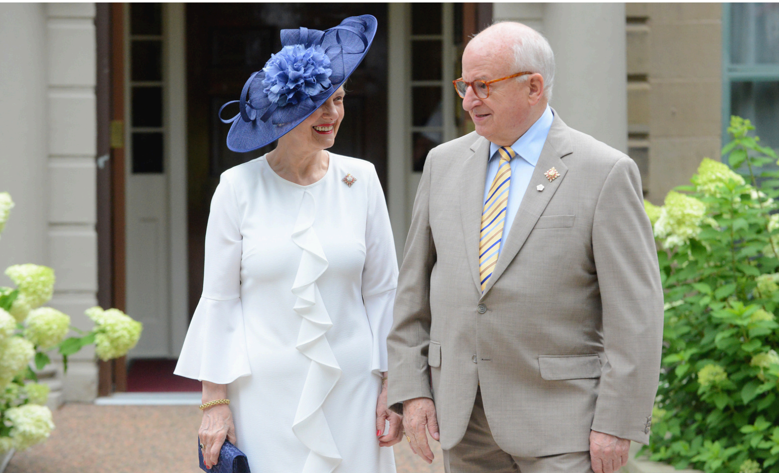
Their Honours at Government House. June 22, 2023.