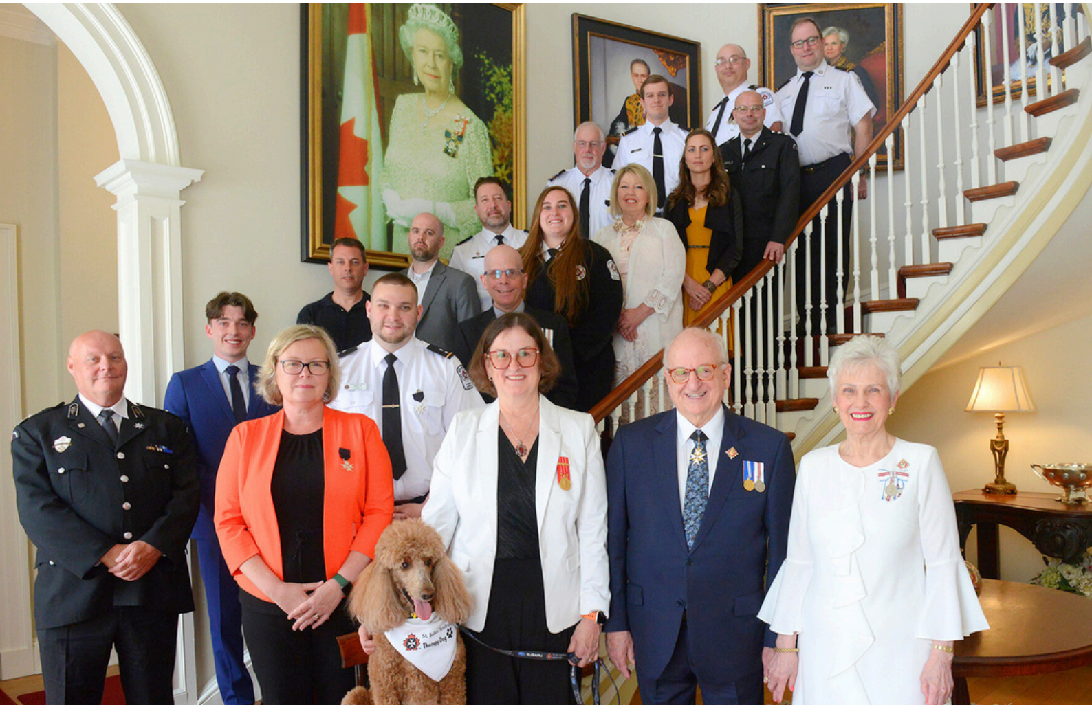
Order of St. John Investiture and Award Ceremony. May 27, 2023.

Throughout the year, the Lieutenant Governor celebrated Nova Scotians that made significant and long-term contributions to their communities, the province, and the country.