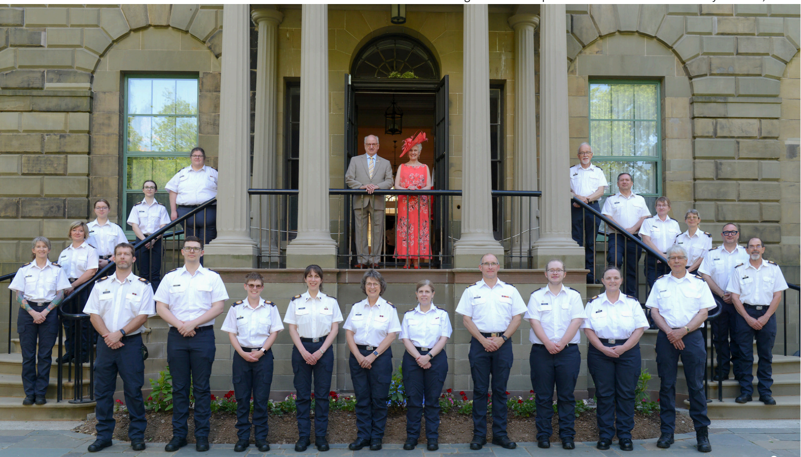
Bridgewater Fire Department Band at the Garden Party. June 22, 2023.