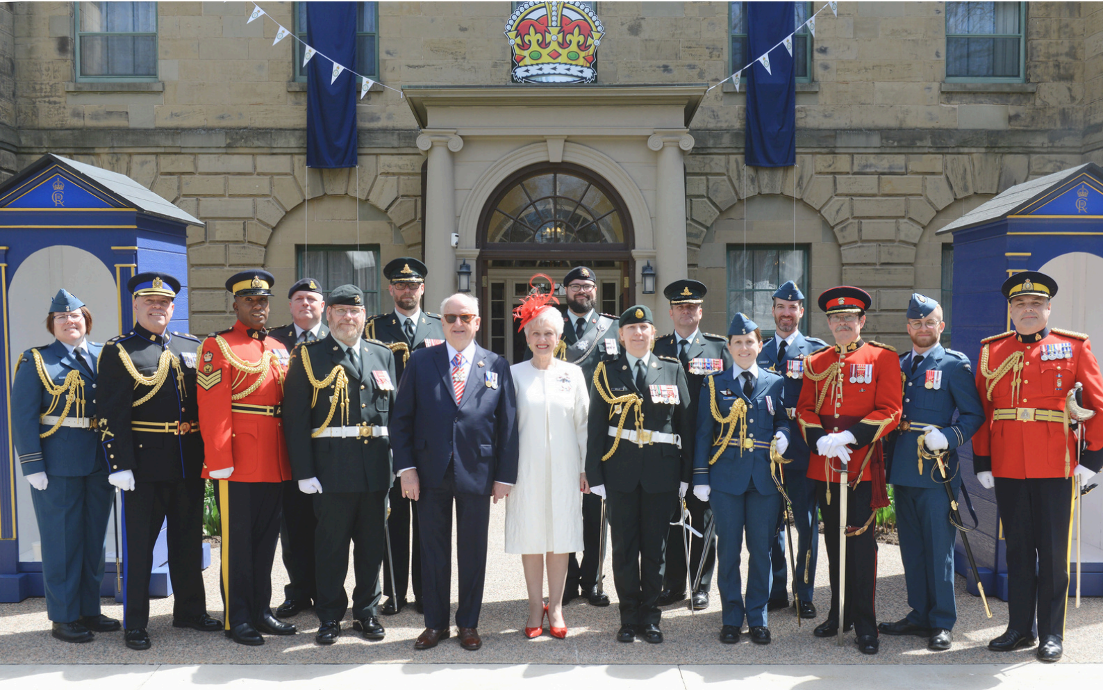
Coronation Flag Raising Ceremony and Outdoor Reception, Government House. May 6, 2023.

On May 6, 2023, Canadians and people throughout the Commonwealth celebrated the Coronation of King Charles III and Queen Camilla. This rare and historic event captivated millions worldwide.