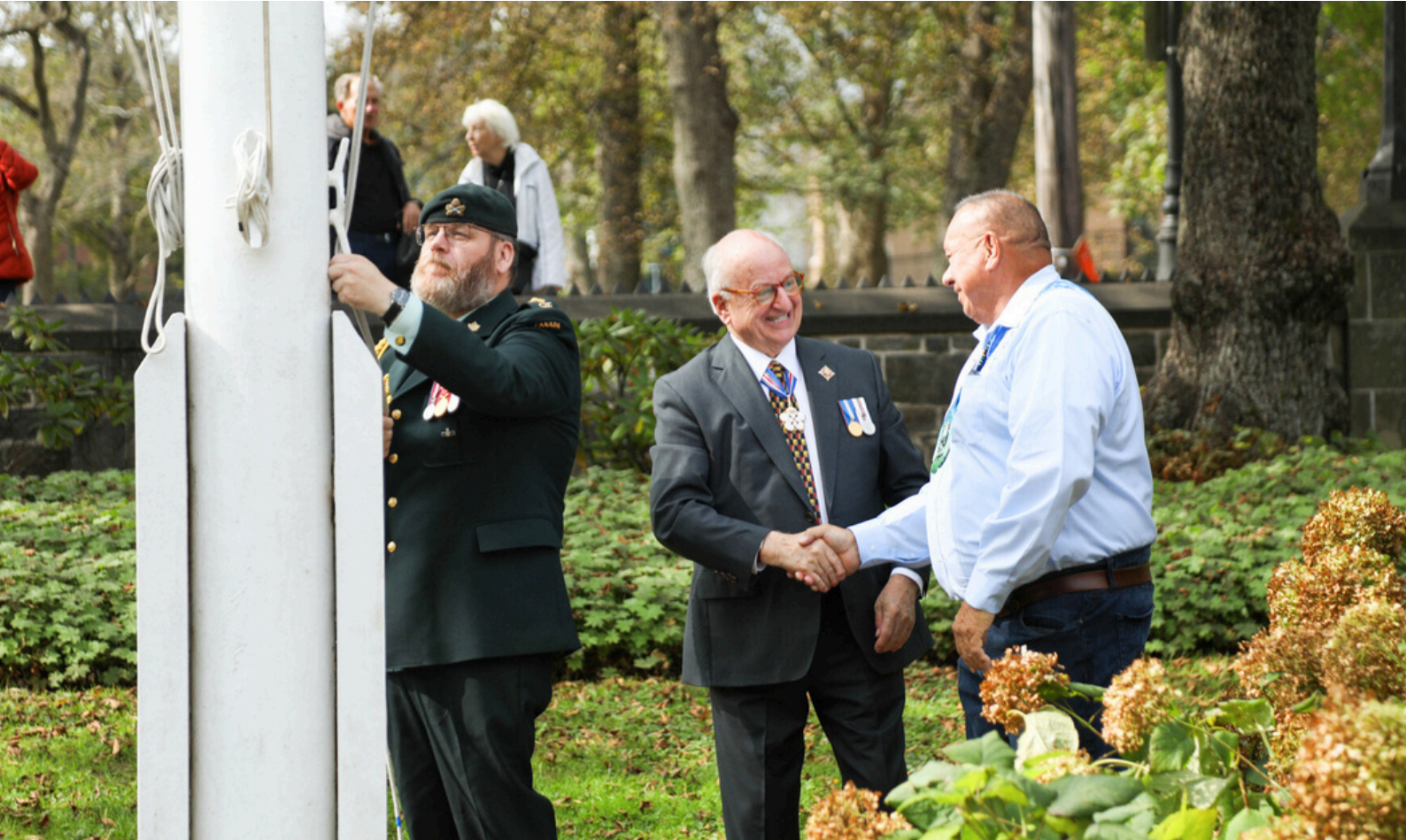
Treaty Day Flag Raising Ceremony and Reception at Government House. October 1, 2023.

Throughout 2023-24, several historic moments provided opportunities to recognize the relationship between the Crown and Indigenous communities.