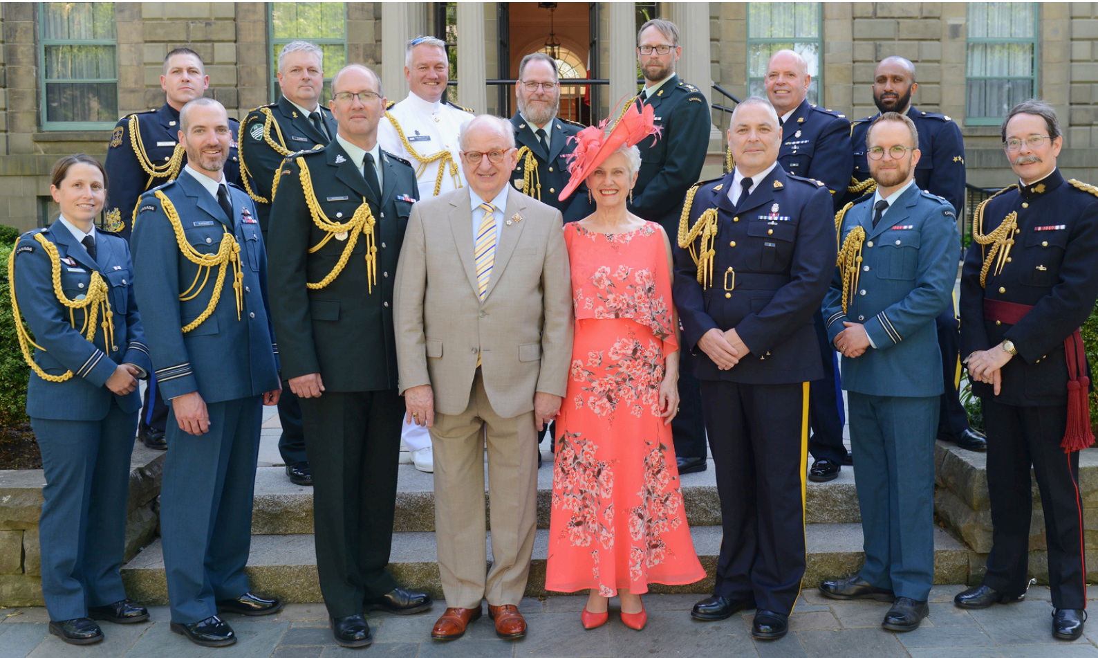
The Garden Party at Government House. June 22, 2023.

The team of 30 Honorary Aides-de-Camp, comprising members from various branches such as the Royal Canadian Navy, Canadian Army, Royal Canadian Air Force, Royal Canadian Mounted Police, Halifax Regional Police, Cape Breton Regional Police Service, and New Glasgow Regional Police, dedicated a total of 2,430 hours to assisting the Lieutenant Governor in fulfilling his duties across Nova Scotia.