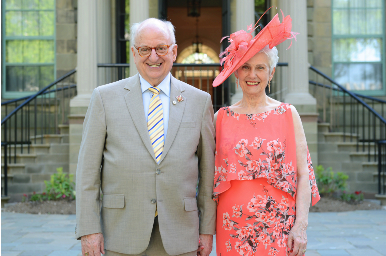
The Garden Party at Government House. June 22, 2023.