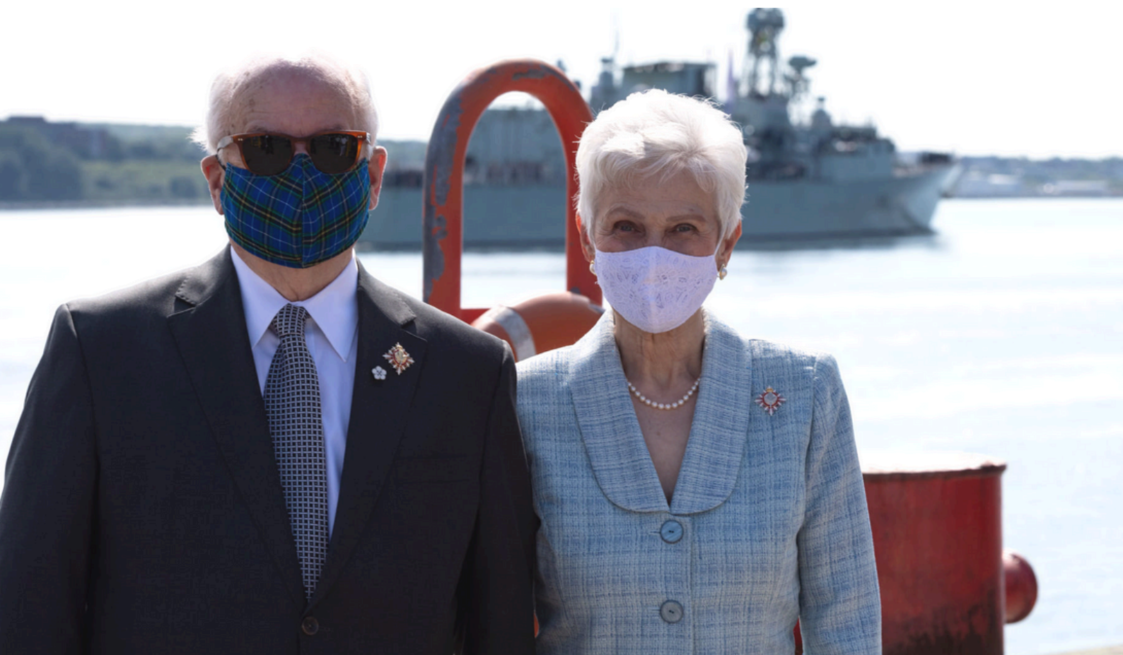
Deployment of HMCS FREDERICTON. 24 July 2021.