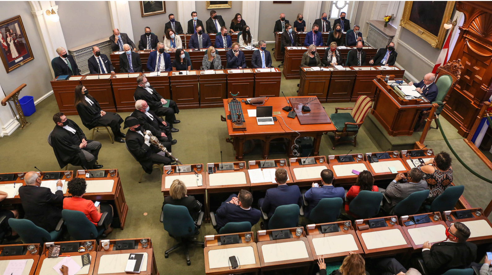
His Honour delivering the Speech from the Throne. 12 October 2021.

At the request of the Premier Iain Rankin, the Lieutenant Governor dissolved the House of Assembly and called a general election on 17 July 2021. Following the election results, Mr. Rankin notified the Lieutenant Governor of his intention to resign as Premier of Nova Scotia. In turn, the Lieutenant Governor received Mr. Tim Houston, leader of the Progressive Conservative Party, and requested that he form a new government.