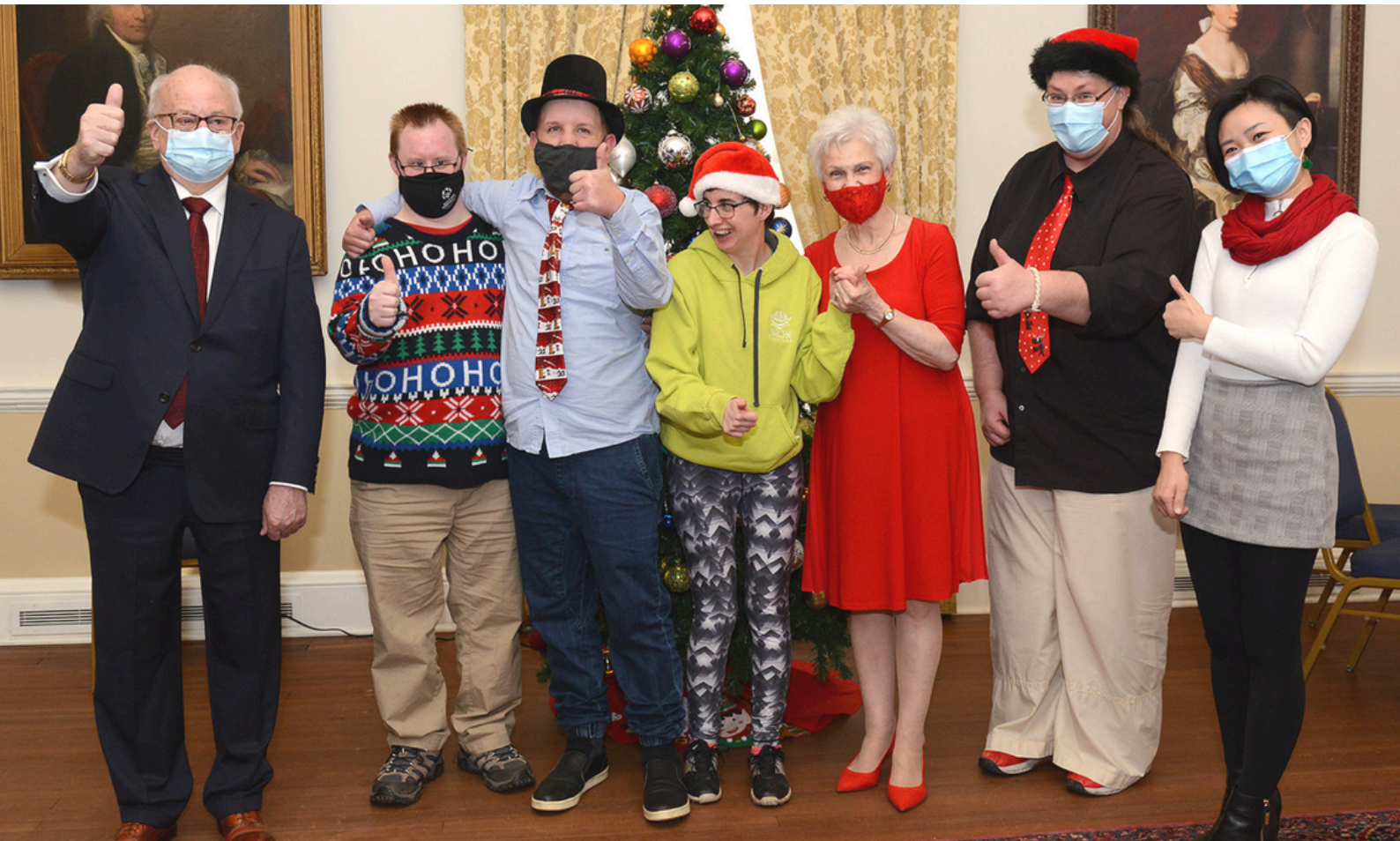
Christmas tree decorating event with L'Arche at Government House. 3 December 2021.

Building on the success of the 2020-21 fiscal year, the Lieutenant Governor continued virtual public outreach activities, particularly during the first half of the year when gathering limits resulted in the cancellation of events and tours. One significant benefit was that residents who cannot physically travel to Government House were able to engage with the Lieutenant Governor online and participate in activities.