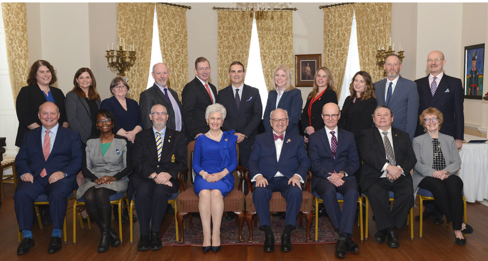
The Queen's Counsel Commissioning Ceremony at Government House. 9 December 2021.