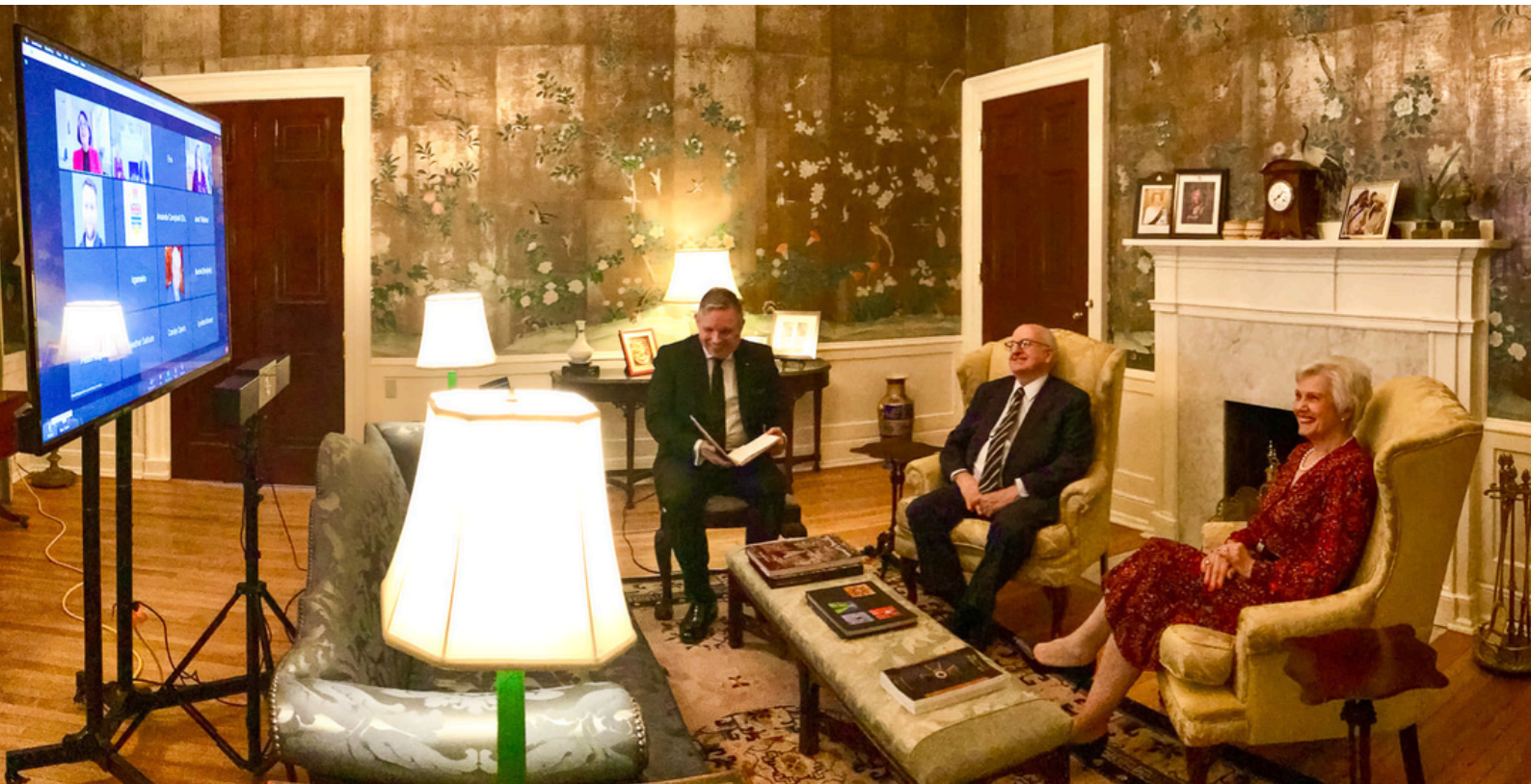
Their Honours participating in a virtual meeting of the Canadian Vice-Regal family. February 2022.

Due to COVID-19 pandemic, the Province remained under a state of emergency during the 2021-22 fiscal year. Despite restrictions on gathering limits and physical distancing requirements, strong engagement with Nova Scotians continued due to the Lieutenant Governor's online presence.