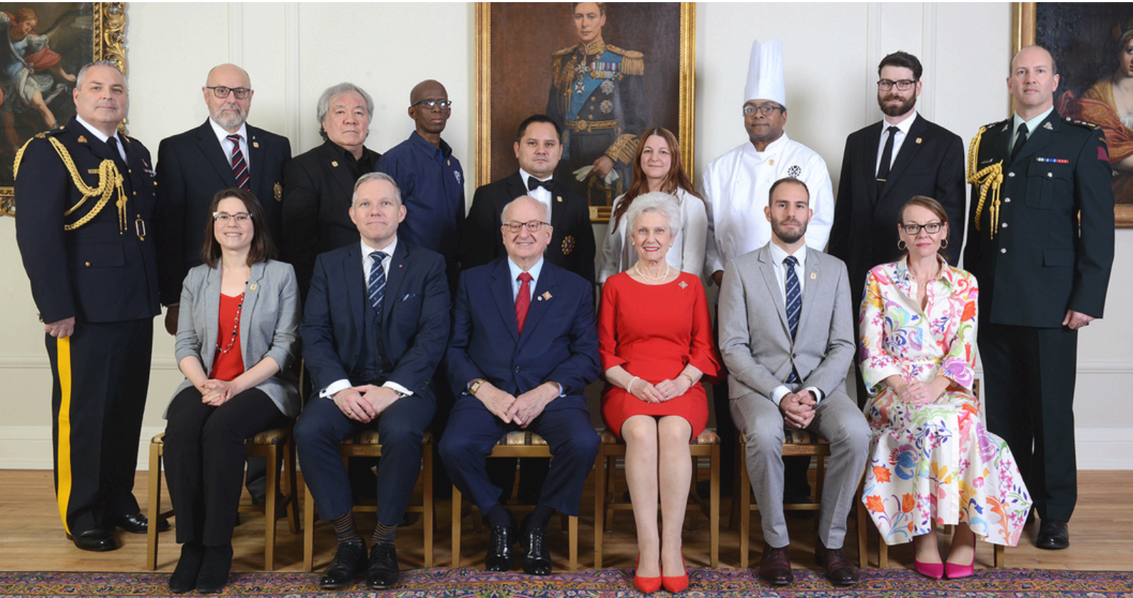
Their Honours and the Vice-Regal Household Staff. January 2022.