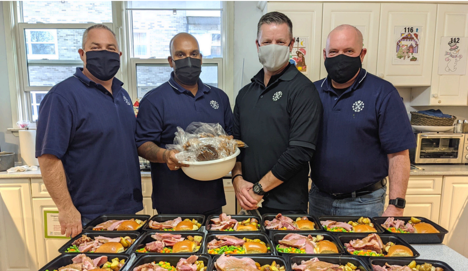
Meal preparation at the Ronald McDonald House Atlantic. December 2021.

The cadre of 31 Honorary Aides-de-Camp, comprised of members of the Royal Canadian Navy, Canadian Army, Royal Canadian Air Force, Royal Canadian Mounted Police, Halifax Regional Police, Cape Breton Regional Police Service and New Glasgow Regional Police, volunteered 1,145 hours aiding the Lieutenant Governor in discharging his duties throughout Nova Scotia.